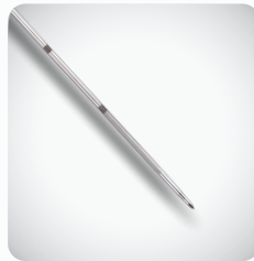
Echogenic Trocar needle

The GaltStick® Introducer System is a 6 French Coaxial sheath assembly with stiffening stylet. The GaltStick® allows for the introduction of a .018" guidewire and .038" working guidewire in percutaneous procedures.