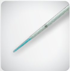
Embedded radiopaque marker band on all sheaths